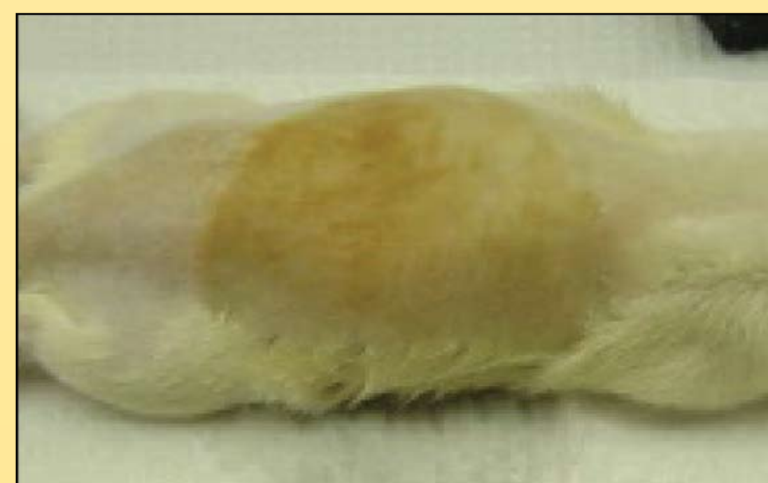
Figure 2. HIN model: full-thickness burn on shaved dorsum

Analyses were conducted using SAS PROC MIXED and limited to comparisons within an experimental day. Upper and lower 95% confidence intervals were calculated along with least-square mean Log 10 (CFU+1) survivors. Significance thresholds for differences were set at P < .05 .